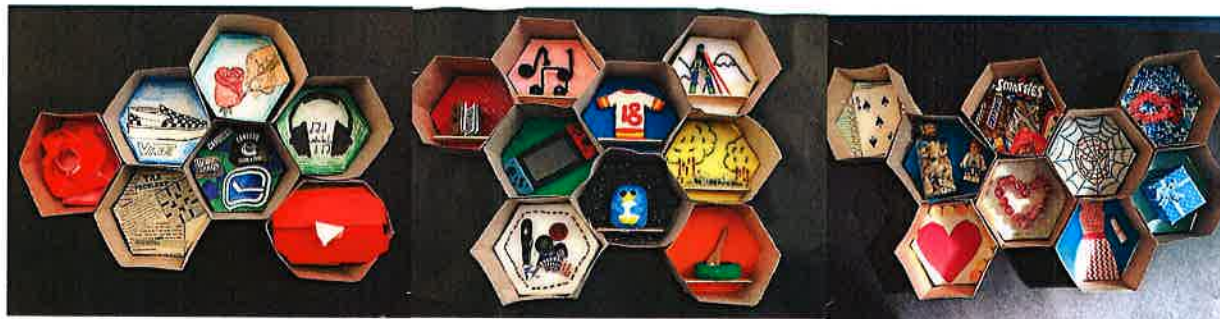
~ Work completed by Division 2 ~