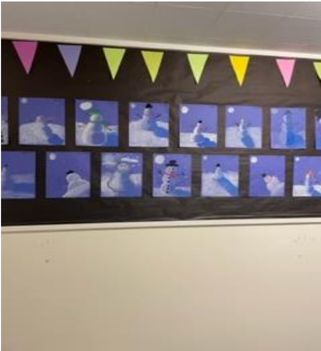
Division 11 – Morrisseau Bears